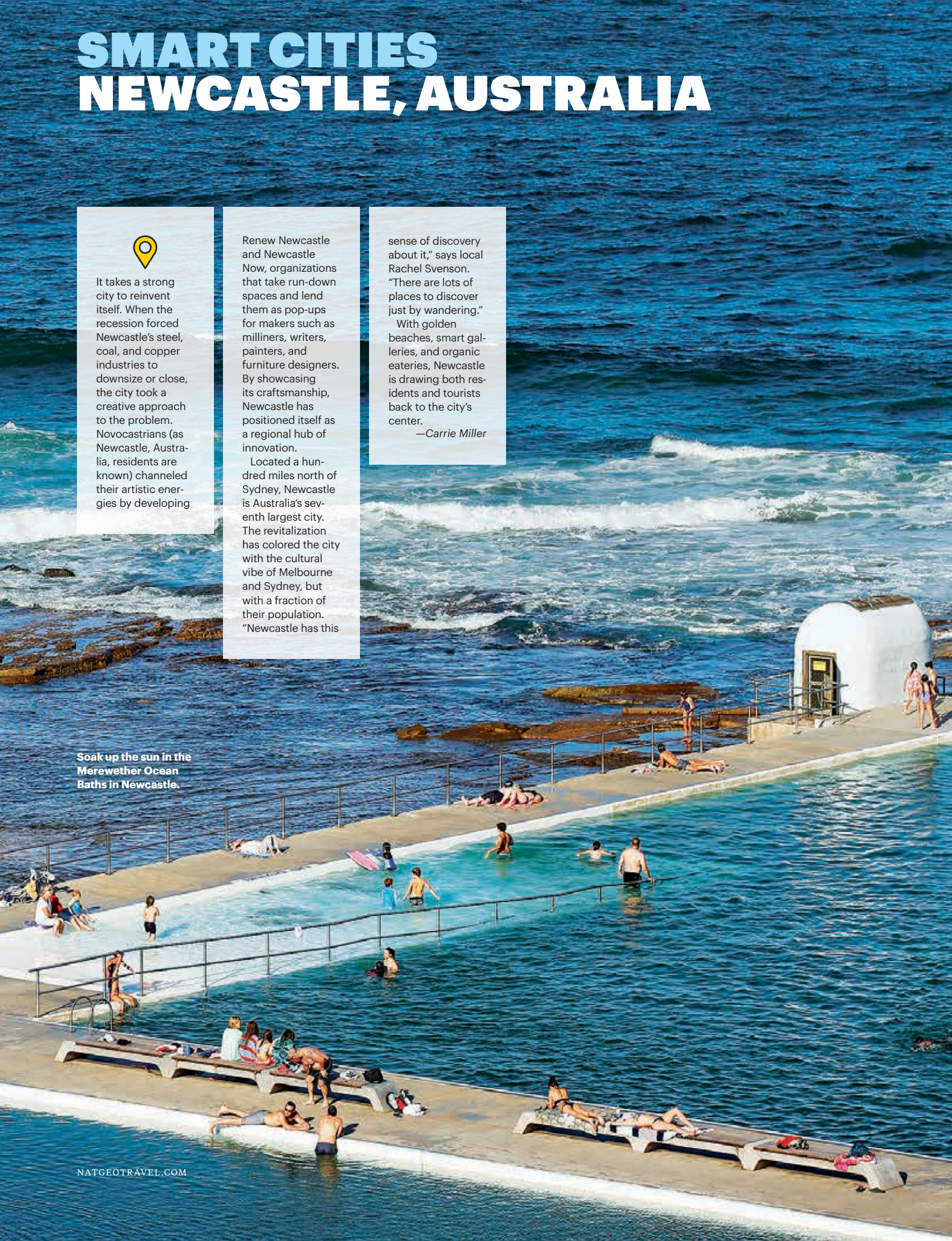
Soak up the sun in the Merewether Ocean Baths in Newcastle.